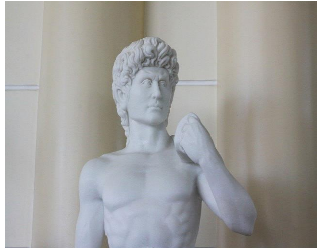
Brutus, the Greek ( the Greek Fire Latro )

That's right! Brutus is Greek! He was the one who robbed the stronghold at the edge of Rome. We now know why the Greek fire was stolen. The thief had to go with what he knew. Brutus' inmate was interviewed. He said, " Brutus was going crazy about the fight!"