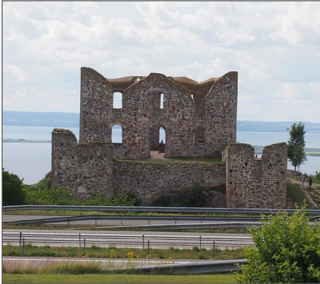
An image of the stronghold that was robbed

Last night, a stronghold at the edge of Rome was robbed. This particular stronghold held items that were from the fallen Greeks. There wasn't much in the stronghold except weapons. The guards were confused as why someone would steal weapons, because Rome had so many. Apparently that's what everyone thought. Because only V guards were posted. The guards were interviewed. They all answered the same. They said, "He was like a ghost."